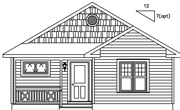
STREET ELEVATION ALPINE ...10526