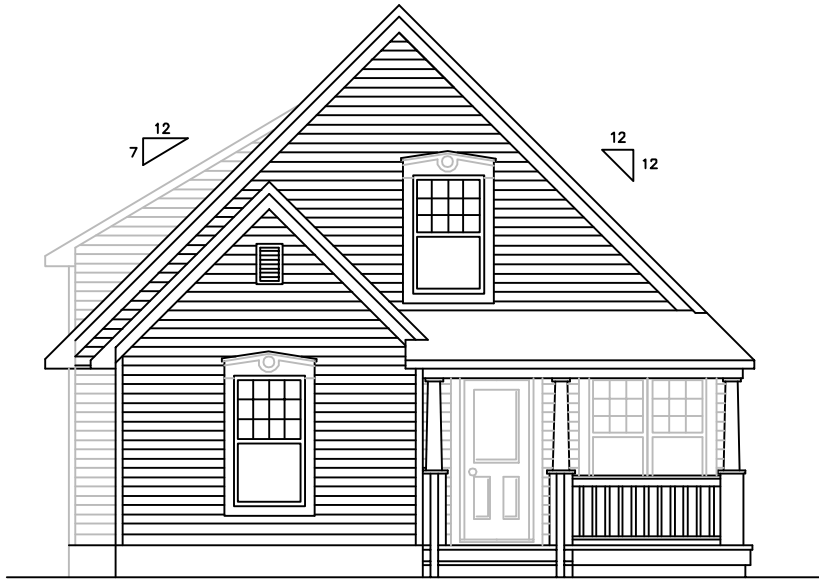
FRONT ELEVATION HARBOR SPRINGS...60002