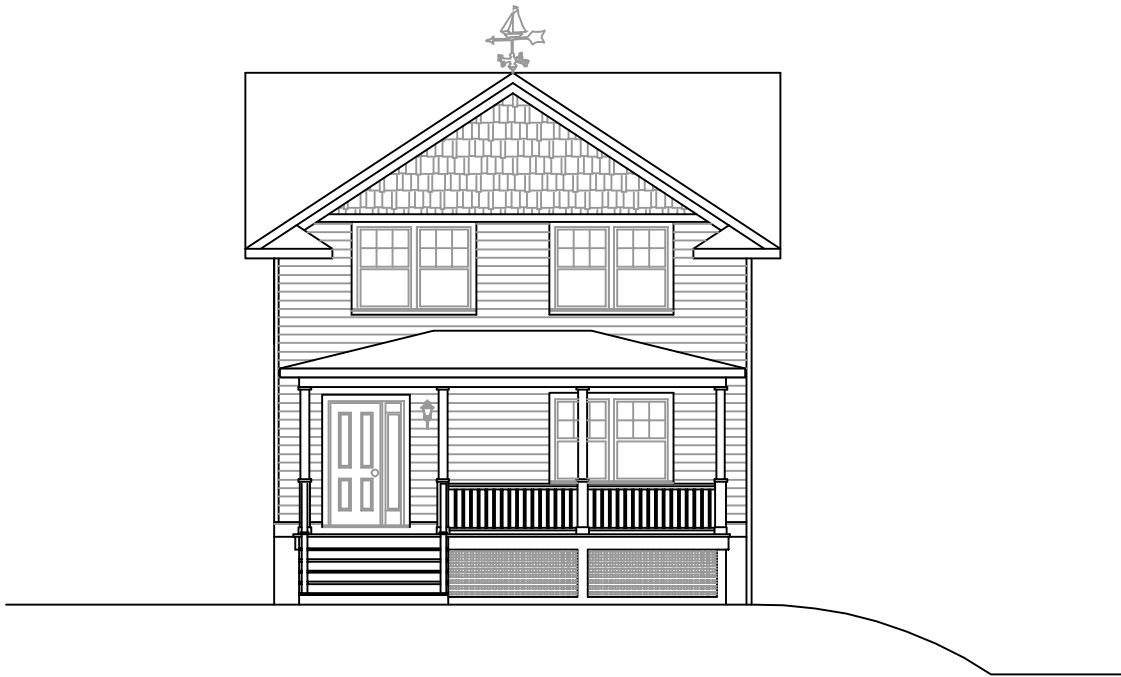
FRONT ELEVATION ROCHESTER 28x52....14042